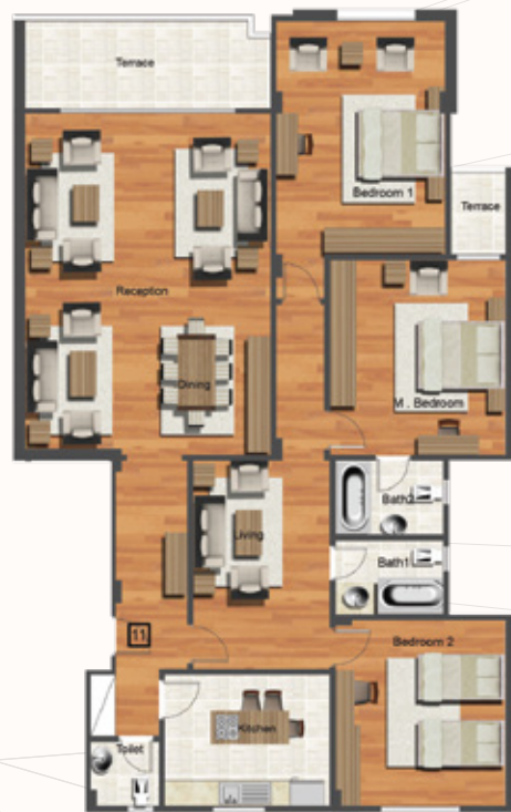
FLAT 11 & 21 & 31