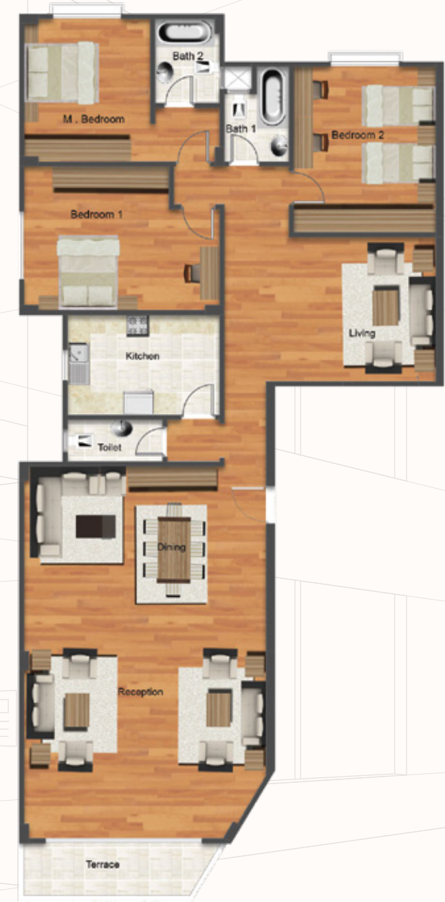
FLAT 11 & 21 & 31

Disclaimer: Drawings are not to scale and the dimensions are approximate. Wadi Degla reserves the right to change in the master plan, all drawing dimensions, areas, and materials without notification. - Any colored images shown are indicative only, actual colors may vary. - Floor plans may be mirrored depending on location on master plan. - In the case of garden level option, stair and terrace details may vary.