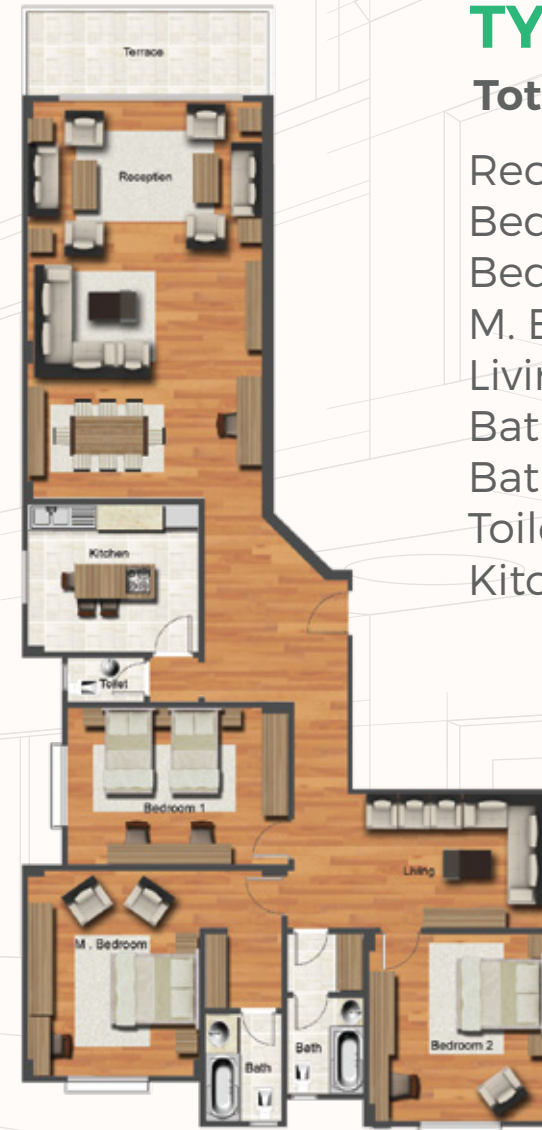
FLAT 13 & 23 & 33