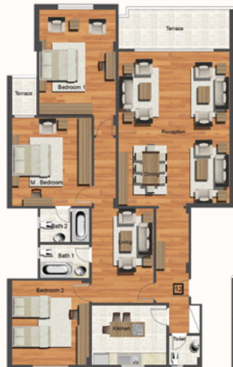
FLAT 12 & 22 & 32