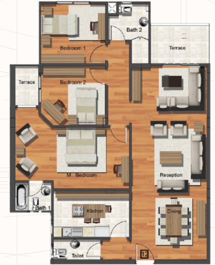
FLAT 12 & 22 & 32