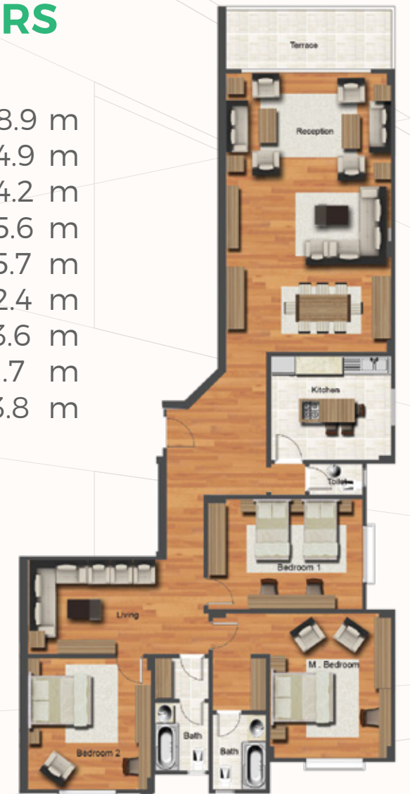
FLAT 11 & 21 & 31

Disclaimer: Drawings are not to scale and the dimensions are approximate. Wadi Degla reserves the right to change in the master plan, all drawing dimensions, areas, and materials without notification. - Any colored images shown are indicative only, actual colors may vary. - Floor plans may be mirrored depending on location on master plan. - In the case of garden level option, stair and terrace details may vary.