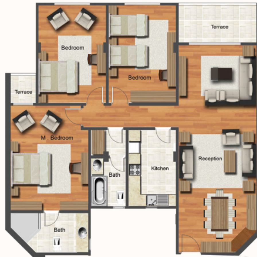
FLAT 12 & 22 & 32