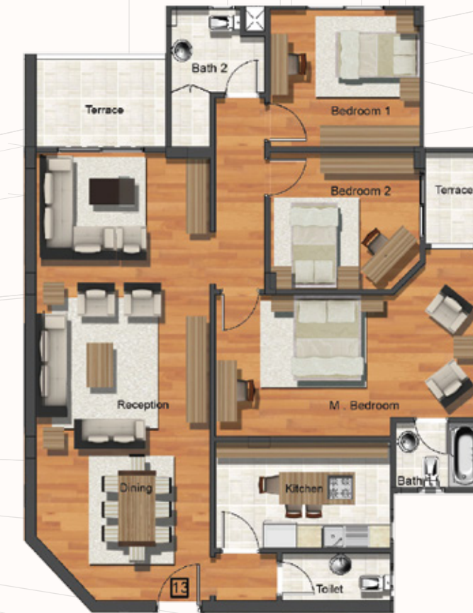
FLAT 13 & 23 & 33